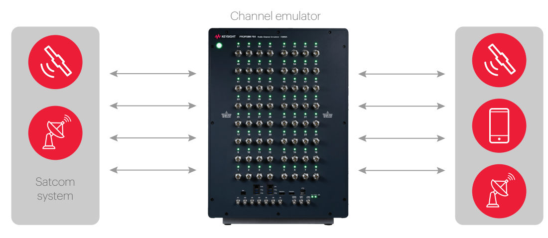
Figure 2. A channel emulator between a satellite communications system and a terrestrial network

Tracking the iterations of hardware and software during development is essential. Objective comparison between variants requires standardizing the operational environment. For full control of the environment, channel emulators can provide an unbiased platform for evaluating performance and comparing different devices, hardware variants, and software iterations; see Figure 2.